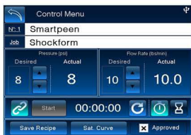
Real-time monitoring of pressure and media flow